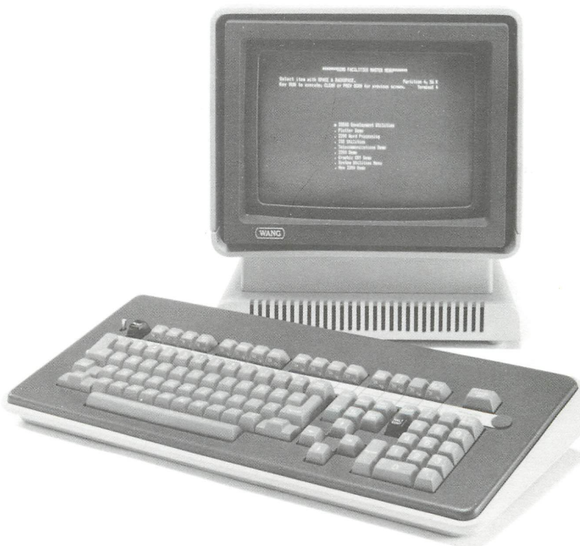
Model 2336DW Terminal

Terminals can be attached to the CPU either locally, at distances up to 2,000 feet (609.6 meters), or remotely, through the use of modems and telephone lines. Optionally, the MicroVP can be equipped with communications controllers that allow remote